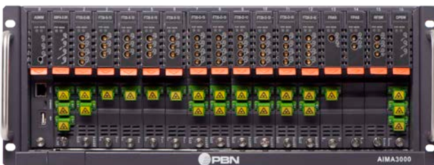
A-ACHA-4U (Example Product - Original)