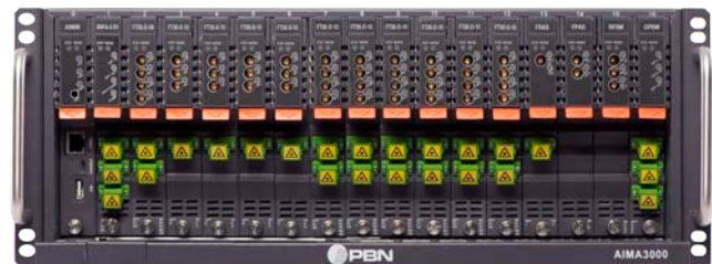
A-ACHA-4U-LGAN (Example Product - New)